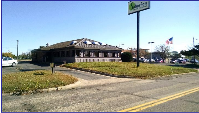
Drive – up window