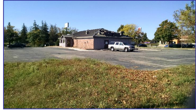
Large parking lot